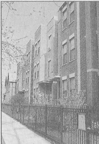
The $17 million Harold Washington United Cooperative consists of 87 units in 18 buildings on 30 lots in the West Humboldt Park neighborhood.